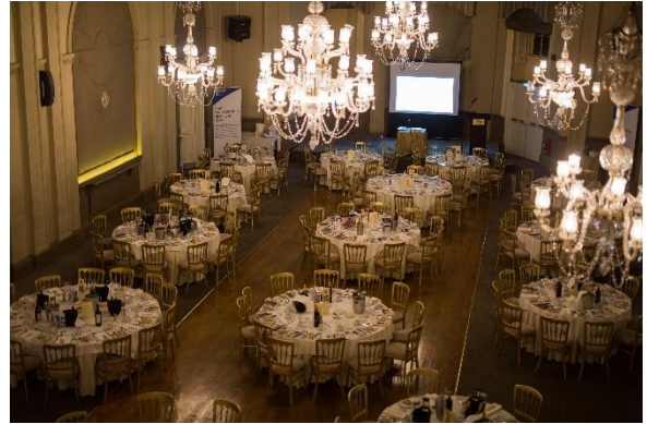
A view from the balcony of the Assembly Rooms