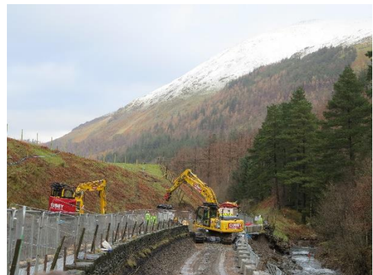
The A591 under reconstruction in Cumbria following Storm Desmond

Whilst the smallest of the sub groups Cumbria have recently delivered a committee meeting in the region in addition to a Committee meeting in Carlisle. The priorities of the group in the coming months is to continue to promote the presence of the Sub Group through emails, networking with local employers and engaging with the other professional institutions.