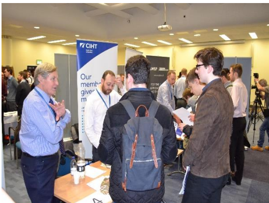
Members of the NE&C promoting the Institution to prospective members

At the heart of the Region, the Northumbria Subgroup are continuing to push ahead and deliver the majority of the events within the Region. With the help of local employers, Guest Speakers and the dedication of Committee Members we continue to identify and deliver the majority of the annual program in this location. In the coming months additional events are planned to be delivered which includes the annual Quiz, Young Persons Presentation Evening and the AGM.